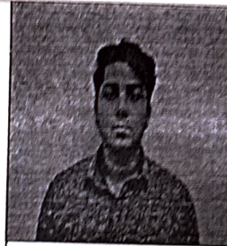
Test Day Photo