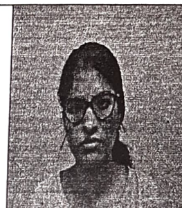
Test Day Photo

Candidate's Contact Details : KADUVETTOOR HOUSE VENNIKULAM PO THIRUVALLA PATHANAMTHITTA, KERALA