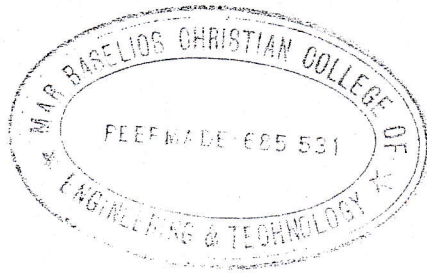
PRINCIPAL Mar Baselios Christian College of Engineering & Technology P.O. Pallikunnu, PeermaDE-685531