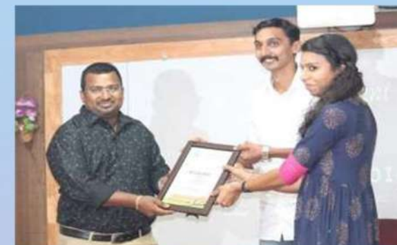
Congratulating newly wedded couple

As a token of love and gratitude, a memento distribution ceremony was arranged for faculties and staff who completed 10 years of experience in MBCET.