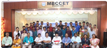
Dignitaries with Participants

The primary goal of this conference is to provide a platform to elaborate the contributions in the field of Electrical and Electronics Engineering. This conference also intends to bring eminent, academicians, researchers, scientists, engineers and students to share their knowledge. Bringing out their innovating ideas and research outputs related to their areas of expertise, their suggestions and improvements to the conference theme.