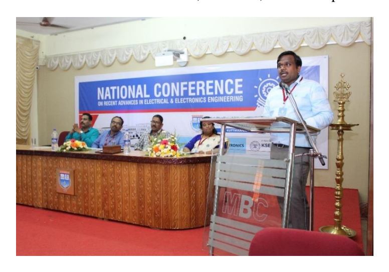
The program ended with national anthem at 3.30 PM