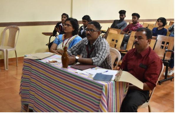
Venue 3- Room No. 126