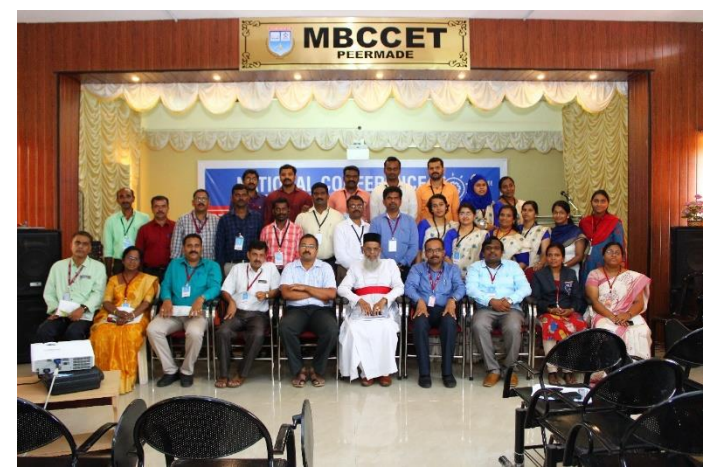
GROUP PHOTO WITH STAFF MEMBERS