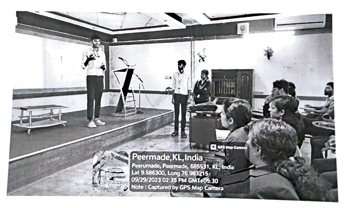
Participant Teams presenting their solutions