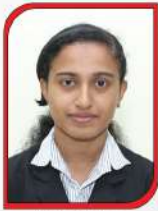
Achsa Binu TENZOTECH