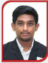
Amal Abi TENZOTECH