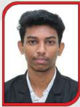
Amal VK FACEPREP, TENZOTECH